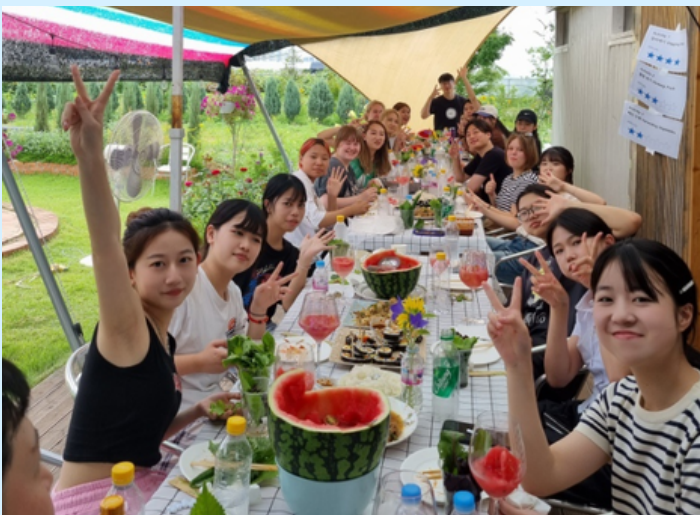
Korean traditional games and Food