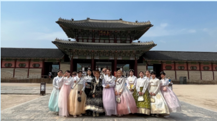
Hanbok experience in the Old Royal Palace