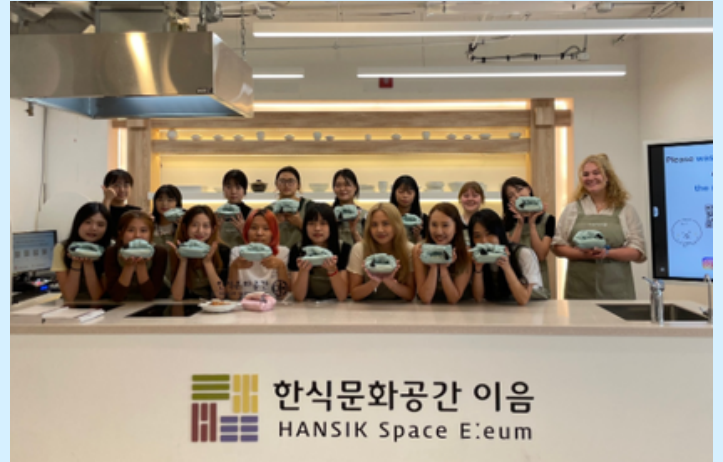
Korean Cooking Class